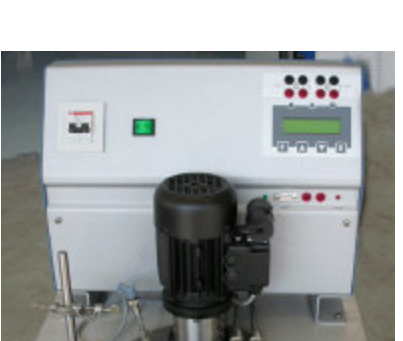
Fluid level adapter