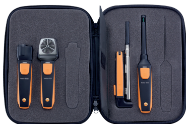
VAC Smart Probe Kit: 0563 0003